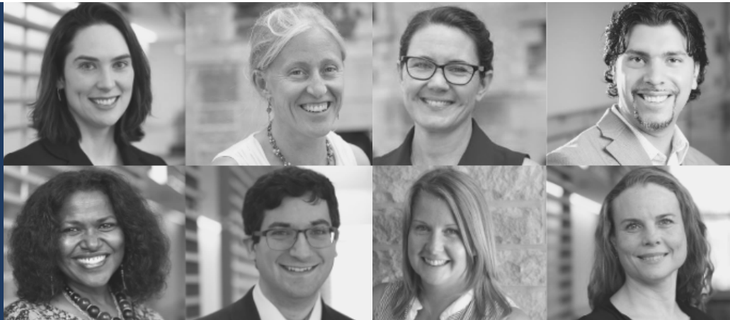
Working Group: Impact of COVID-19 on Health Equity & Disparities

Our commitment to health equity requires us to work to reduce and eliminate disparities in health outcomes—to ensure social justice in health.