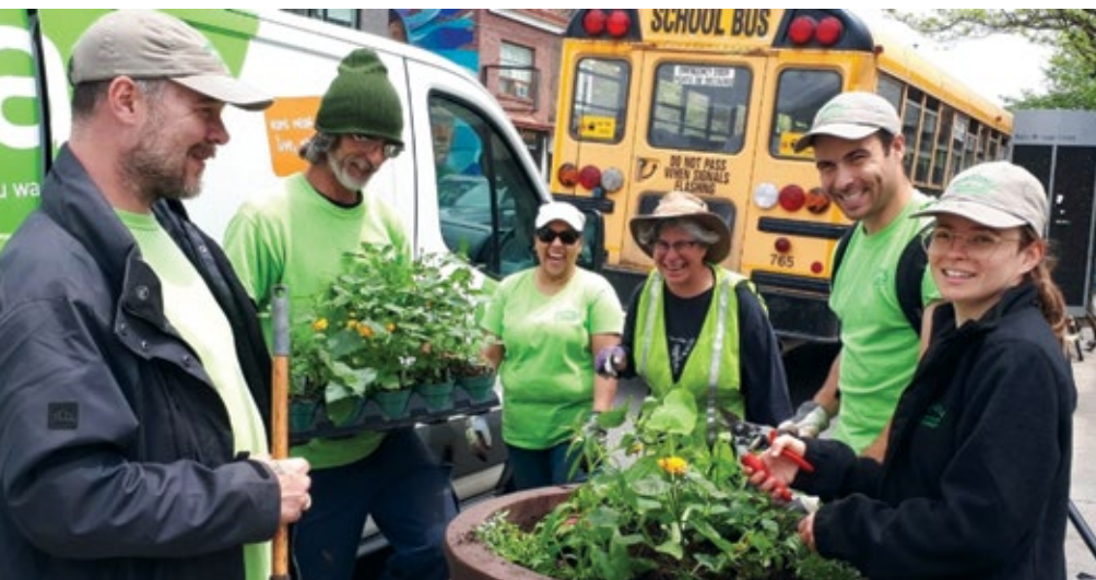
(left) Social enterprises are designed to aid in job creation for marginalized groups, such as those with disabilities.

One approach is to stop trying to crack open a seemingly impenetrable door, and instead proactively create workplaces that embrace the qualities known to promote health and worker success. Social enterprises that are designed for the purpose of job creation for marginalized groups have been in existence internationally for more than 50 years. Originating in Europe and Asia in various forms, social enterprises are businesses that operate in the open marketplace with a social purpose, which in the case of work integration social