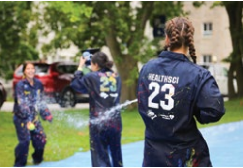
(left) A first for FHS: On-Campus Bachelor of Health Sciences students celebrating Orientation Week.

This past September, if the fall colours, cheering, and clusters of students moving through campus and taking over City Park last didn't give it away, a new cohort of students started their studies at Queen's.