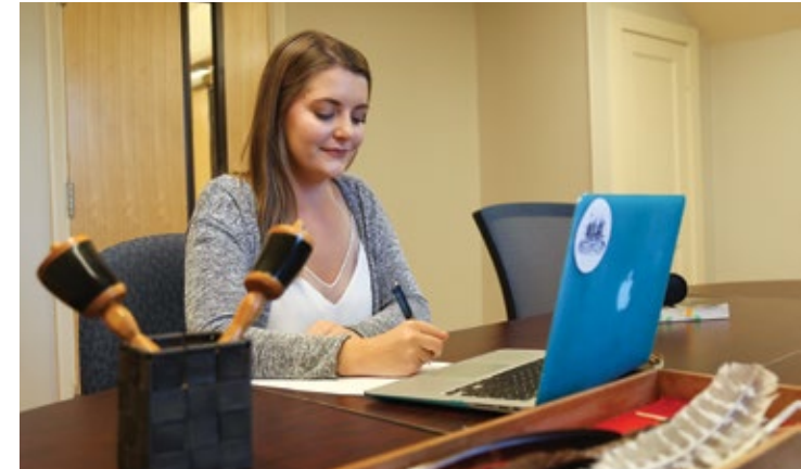
(above) Indigenous students at FHS have access to culturally safe support not only from our faculty, but from partners on campus, such as the Four Directions Indigenous Student Centre.